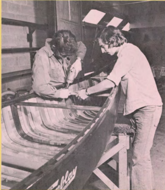
Applying our newly designed rawhide seat. (See page no. 8)