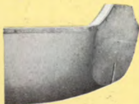
Square stern: Optional on the Lachine 18'

This is a specially designed canoe — used by hunters or for freighting where it is often necessary to operate in shallow water. The stern is designed to permit the propellor of the out-board motor to continue to operate even when the depth of water is only sufficient to float the canoe. Especially adaptable to fast water — Slat Style Stern seat standard equipment.