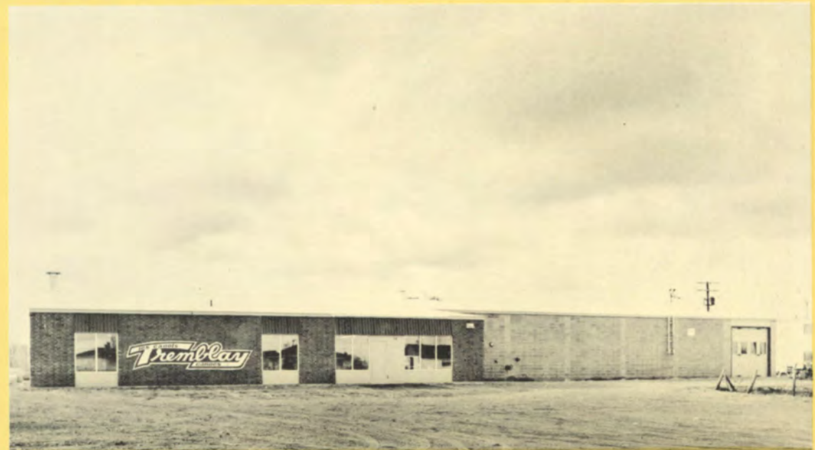
The new headquarters for Tremblay Canoes.