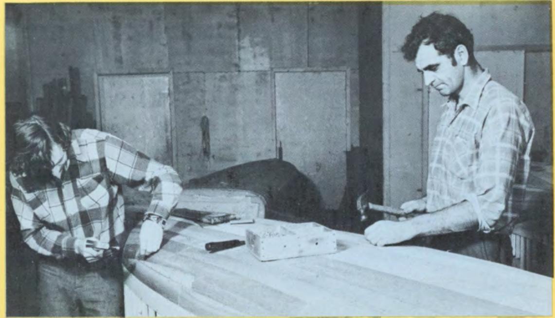
Applying the selected cedar planking on our Chibougamau style canoe.

To continue to meet the ever increasing demand for Tremblay handcrafted canoes, we open in 1975 our new plant. Through improved production methods and the manufacturing area increased three fold, we can not only guarantee delivery but actually improve our already proven level of quality.