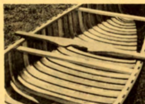
Canoe Carrying Yoke $17.00

Verolite: The modern canoe covering exclusive with Tremblay. A plastic coated canvas in red, green or orange, reduces canoe weights by approximately 5 lbs. Requires no periodic repainting thus Verolite canoes do not take on added weight with the years. Verolite is much more damage resistant than standard painted canvas. Verolite is the one major improvement in canoe construction in the past 50 years.