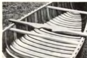
Canoe Carrying Yoke