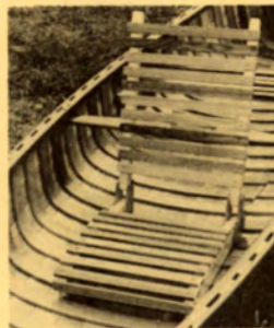
Canoe chair 16'' Wide 4'' Bench Rest 25'' Back Rest $14.50