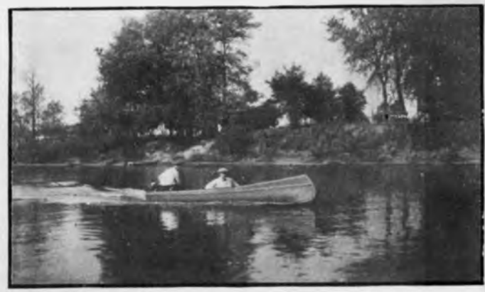
Trial test on the Meramec, developing a speed of 12 miles per hour.