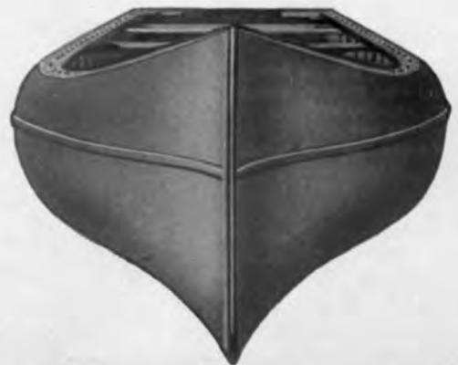
Bow view showing V bottom, graceful lines and sponson construction.